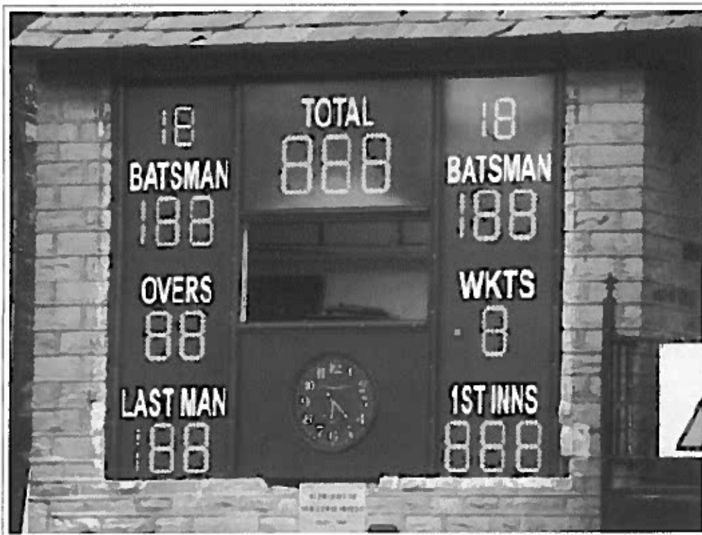
Image: a recent scoreboard refurbishment